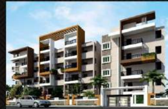
RUCHIRA LILIUM - KADUGODI