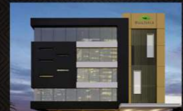
RUCHIRA IV TOWERS - WHITEFIELD