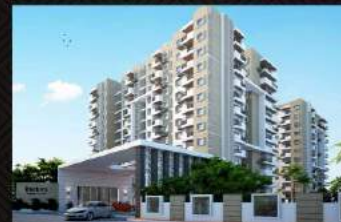
RUCHIRA IRIS - WHITEFIELD